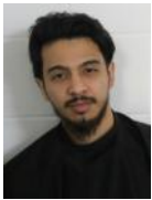
CRUZ, RICARDO JOHNNY

40-5-20 - DRIVING WHILE UNLICENSED OR EXPIRED LICENSE - Cleared by Arrest 40-6-391(A)(1) - Driving Under Influence of Alcohol - Cleared by Arrest 16-10-24(A) - WILLFUL OBSTRUCTION OF LAW ENFORCEMENT OFFICERS - MISDEMEANOR - Cleared by Arrest - 6 counts 17-6-12 - FAILURE TO APPEAR - FELONY - Cleared by Arrest 40-6-40 - Driving on Wrong Side of Roadway - Cleared by Arrest 40-6-48 - Failure to Maintain Lane - Cleared by Arrest 40-6-180 - TOO FAST FOR CONDITIONS (Basic Rules) - Cleared by Arrest