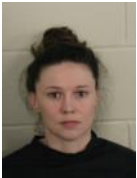
PAYNTER, CHRISTINA NICOLE

23 Male White 115 E 14TH ST SW, ROME, GA 30161 10/03/22 ROCKMART RD AT ISBELL RD QUIJADA, EDGAR Floyd County Police Department 16-10-24(A) - WILLFUL OBSTRUCTION OF LAW ENFORCEMENT OFFICERS - MISDEMEANOR - Cleared by Arrest - 2 counts 40-5-121(A) - DRIVING WHILE LICENSE SUSPENDED OR REVOKED (MISDEMEANOR) - Cleared by Arrest 40-6-181 - Speeding in Excess of Maximum limits - Cleared by Arrest 40-6-72 - stop signs and yeild signs - Amended (CCH 349) 40-6-395(B)(1) - FLEEING OR ATTEMPTING TO ELUDE A POLICE OFFICER - Cleared by Arrest