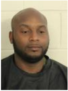
THOMPSON, JEREMY LIONEL

40 Female White 121 SOUTHERN TRACE CROSSING, ROCKMART, GA 30153 07/05/20 LOVE ST @ FANNIN ST CAVE SPRING Cave Spring Police Department Transferred